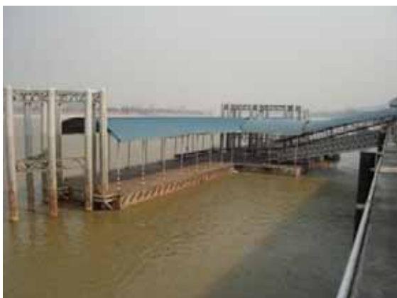
Chiang Saen Port along the Mekong River in Thailand