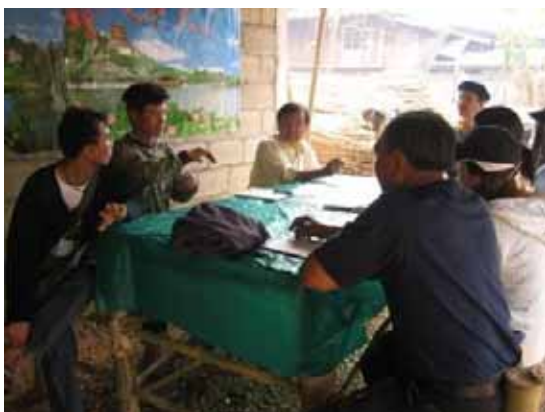
Meeting with a fisherfolk in Had Pai Village