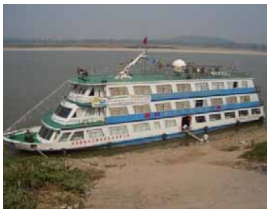
Mekong tourist boat between Jinghong in China and Chiang Saen in Thailand