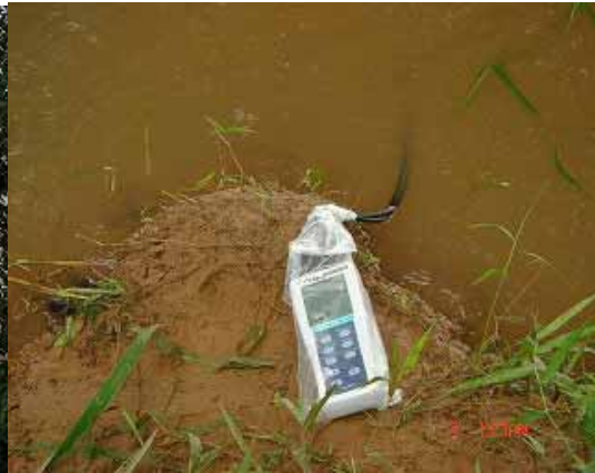
Equipment to measure river depth