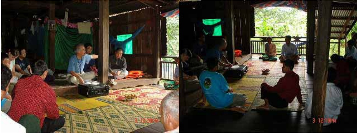
Talking with the villagers in Fang village along the Se San River

On the way back to Banlung, the team stopped over at the Se San Knowledge Center and looked at the fishing gears that have been used in the region for generations and the pictures of various fish species living in the Se San River.