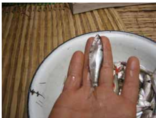
Plaa Soy recently reduced in catch