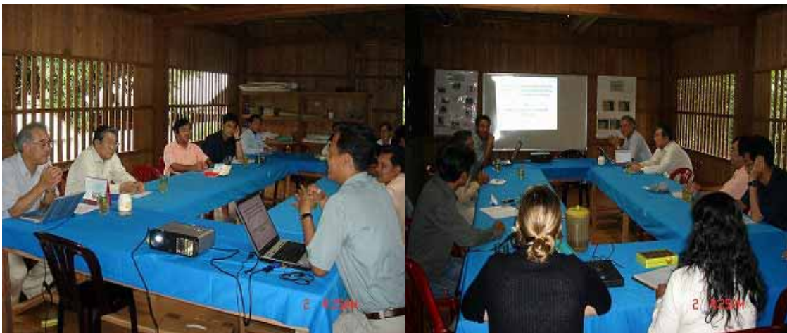
Meeting with 3SPN at the office in Banlung