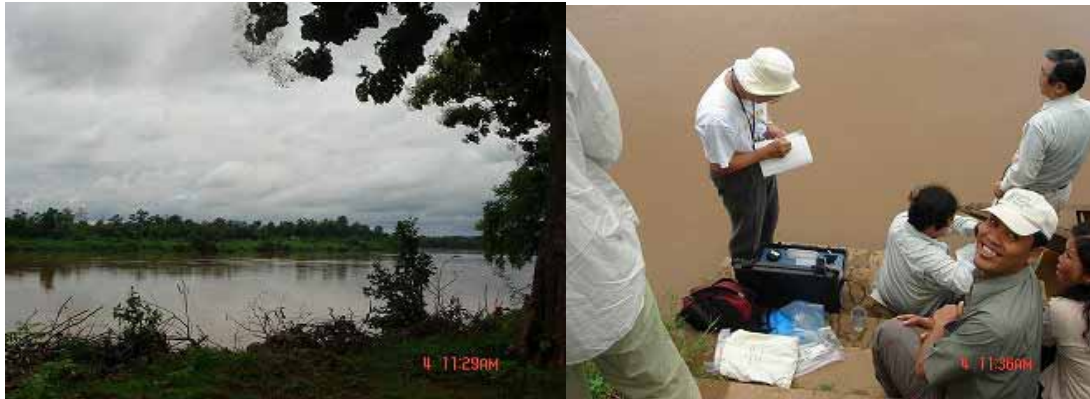
Measuring water depth in the Sre Pok River

The participants visited the Sre Pok River the next day to observe again the river condition. The equipment called Hydrolab, rented from the RDI-Cambodia Laboratory, was used to measure the river depth. The team has also attempted to catch fish samples, but failed as the water level was too high for fishing.