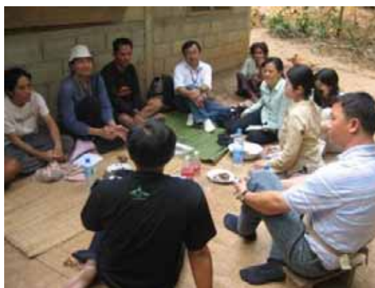
Meeting in Muang Kan village