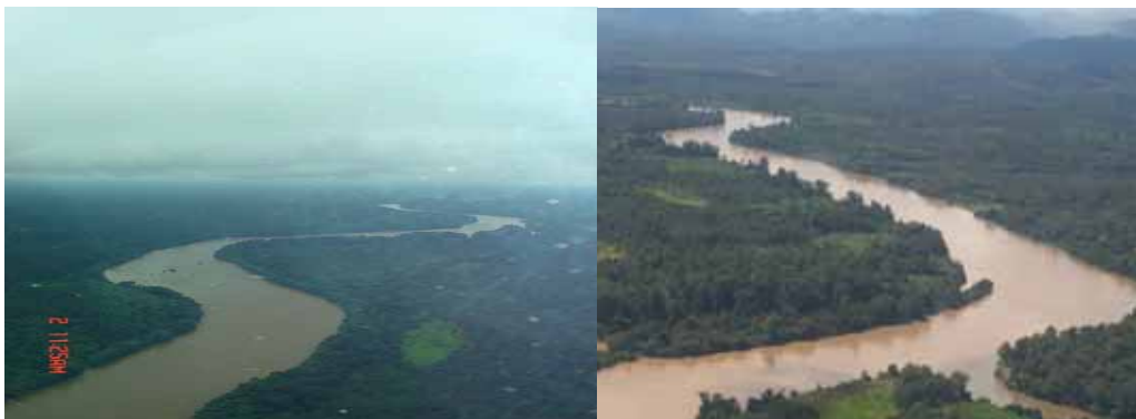
Se San River

After going over the Se San River by a propeller plane, the team arrived at the provincial town Banlung in Ratanakiri province.