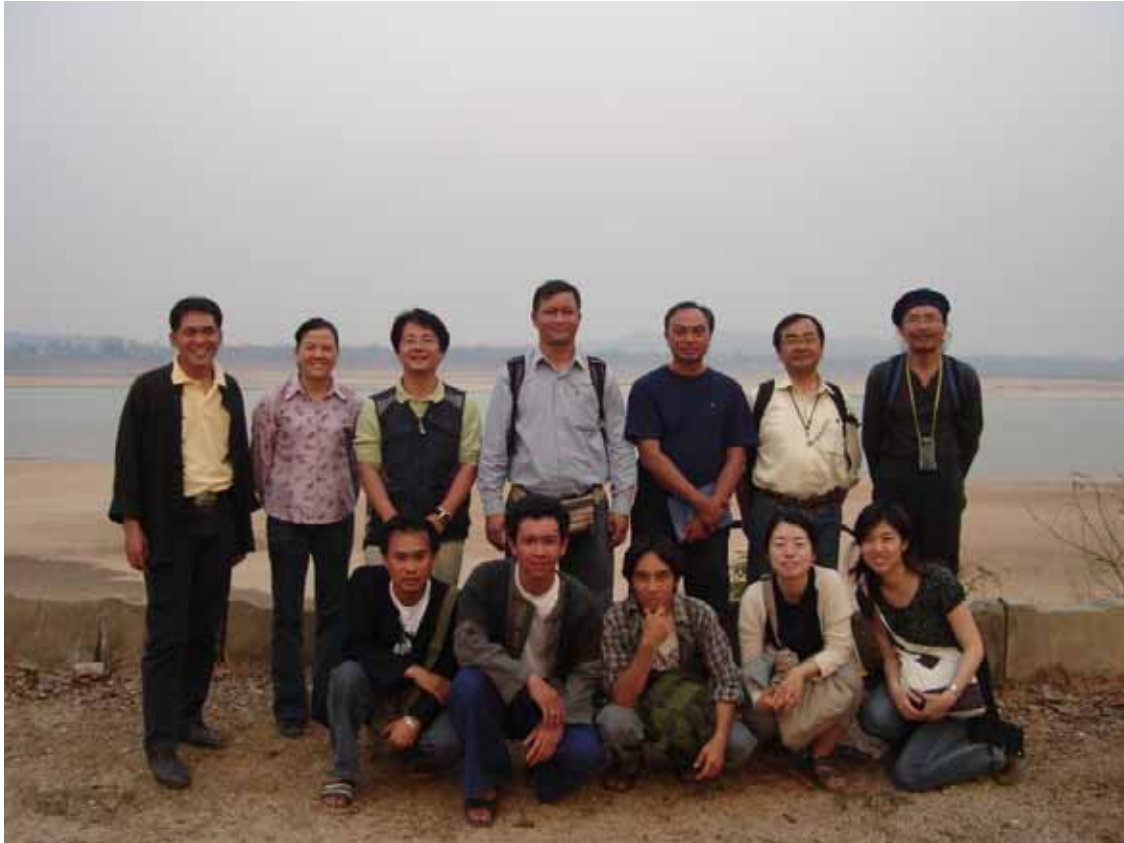
All the participants of this field study in the Northern Thailand, just in front of the flow of the Mekong River in Chiang Saen.