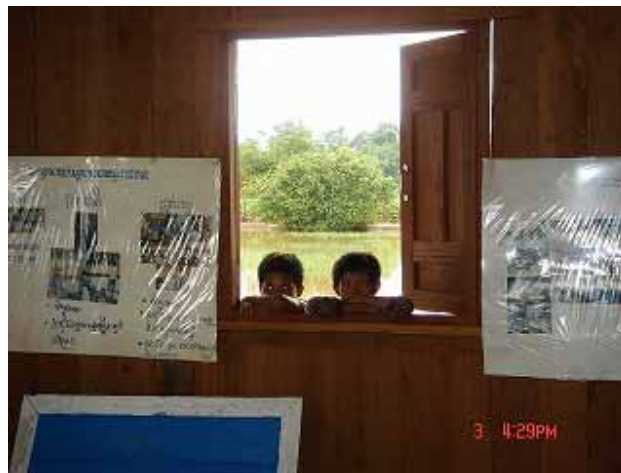
Se San Information Center

On the way back to Banlung, the team stopped over at the Se San Knowledge Center and looked at the fishing gears that have been used in the region for generations and the pictures of various fish species living in the Se San River.