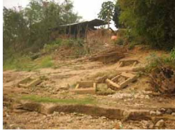
Soil erosion in Pak Ing Tai Village

Interview with villagers in the Huay Luek village