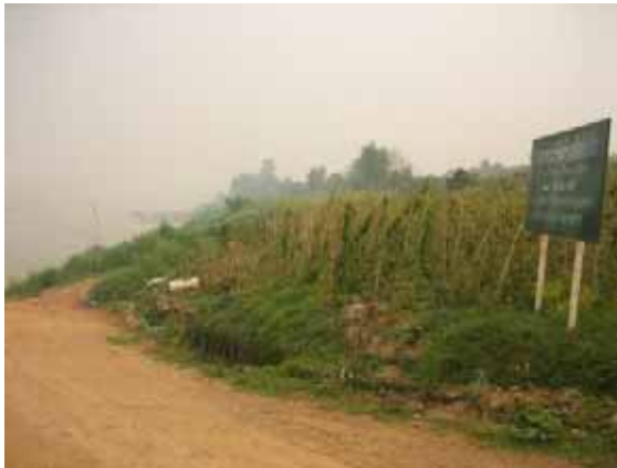
Houay Luek Village set up its own Fish Protection Area (300m downstream from the blue board on the bank)