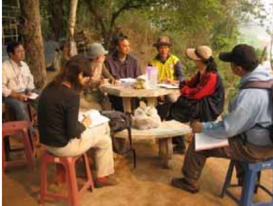
Meeting in Pak Ing Tai Village