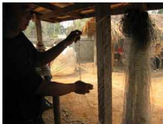
Villagers innovate a new net, which contains three different sizes of mesh to adapt the changes of habitats of the fish.