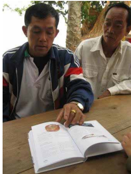
Villagers explain the decreased fish species by using the local fish catalog published by the NGO.